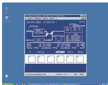
CONTACT remote control software