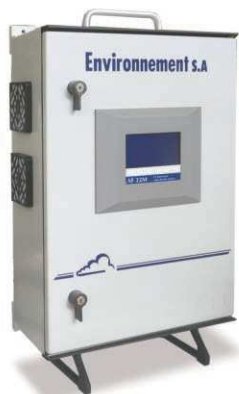
AC32M tight box version