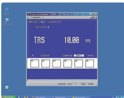
Remote control using ConTACT™ software